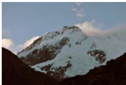
Aoraki Mount Cook