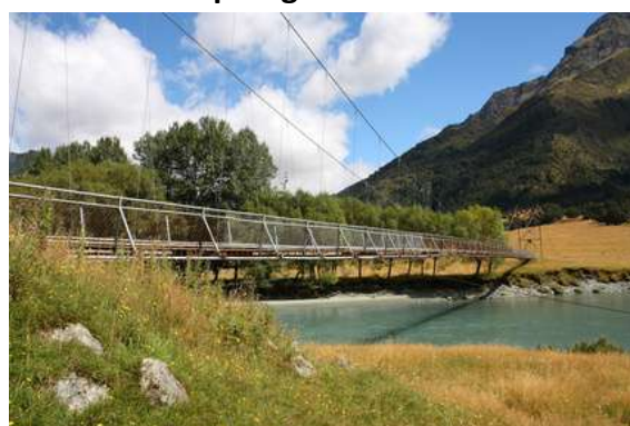
Mount Aspiring National Park

Mount Aspiring is New Zealand's highest peak and is positioned in a land flowing with mountains, glaciers, river valleys and alpine lakes.