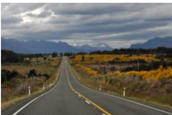
The Famous Milford Road

No road encompasses the scenic beauty of New Zealand quite like Milford Road.