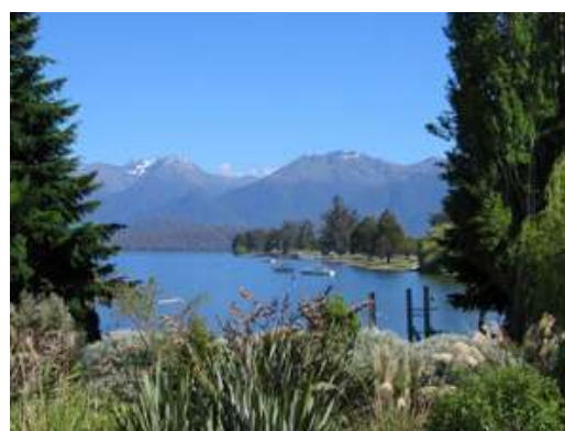
Lake Te Anau