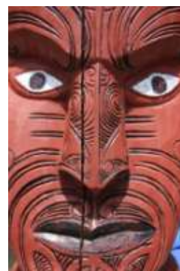
Wood crafted Mask