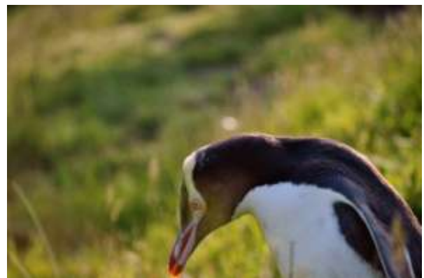
Yellow Eyed Penguin