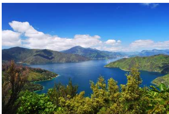
Queen Charlotte Sound

Journey north up the coast of the South Island, passing some spectacular coastal scenery and passing through wonderful towns like Kaikoura, Blenheim and Picton, until you reach the superb Queen Charlotte Sound. Located within the Marlborough Sounds region, Queen Charlotte is characterised by deep river valleys, majestic mountain terrain and stunning natural forest.