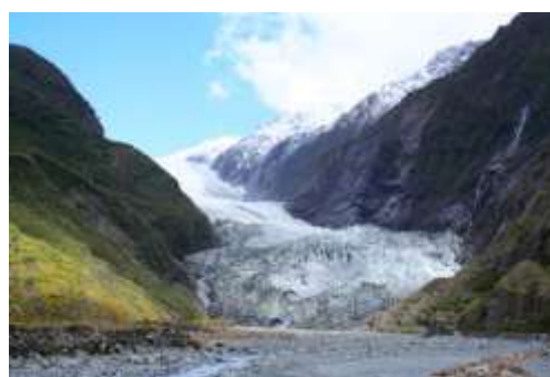
Franz Josef Glacier