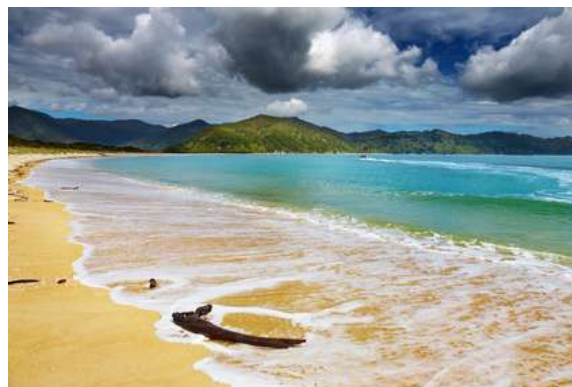
Abel Tasman Coast